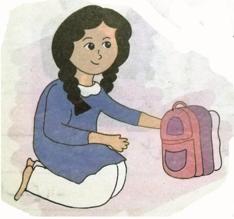
زارا نے بستہ کمرے میں رکھا۔